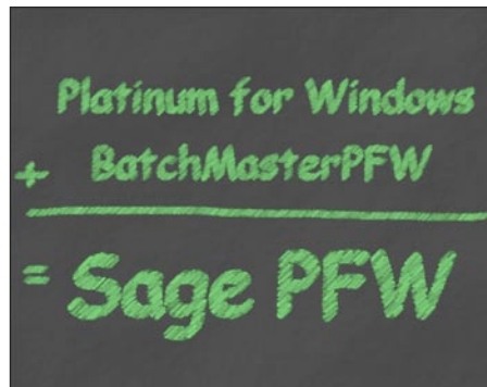
Platinum for Windows by Best and BatchMasterPFW are now Sage PFW!

P latinum® for Windows by Best and BatchMasterPFW™ are now combined into one comprehensive solution—Sage PFW ERP. The powerful financial, distribution, and process manufacturing applications have been combined. With the release of Sage PFW 5.4, modules that were part of BatchMasterPFW will now be referred to as Sage PFW Process Manufacturing modules. The modules associated with the former Platinum for Windows by Best are now the Sage PFW Accounting and Distribution modules. In this article we discuss the changes and enhancements introduced in Sage PFW version 5.4. We've grouped the changes into Global, Sage PFW Accounting and Distribution, and Sage PFW Process Manufacturing module enhancements.